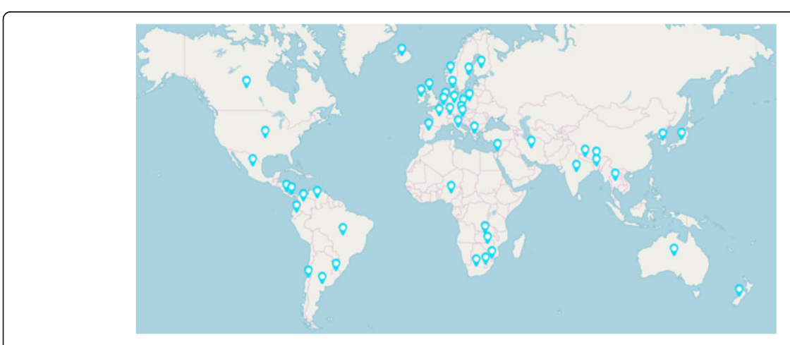
Fig. 1 Countries represented in this study

Out of a total of 109 invitees, 83 accepted nominations to collaborate in the project. Over 10 weeks between 26 February and 10 May 2018, 82 collaborators, working individually or as teams within a country, completed the questionnaires. One participant died during the study so that data were obtained for 48 of the 49 countries that came together in the collaboration (Fig. 1): Argentina, Australia, Austria, Bangladesh, Belgium, Bhutan, Brazil, Canada, Chile, Colombia, Costa Rica, Czech Republic, Denmark, Ecuador, Finland, France, Germany, Greece, Iceland, India, Iran, Israel, Italy, Japan, South Korea, Lesotho, Mexico, Nepal, the Netherlands, New Zealand, Nigeria, Norway, Panama, Poland, Ireland, Slovenia, South Africa, Spain, Swaziland, Sweden, Switzerland, Thailand, United Kingdom, United States of America, Uruguay, Venezuela, Zambia, and Zimbabwe. There were six countries from Africa, 19 from Europe, two from the Middle East, seven from Asia, two from