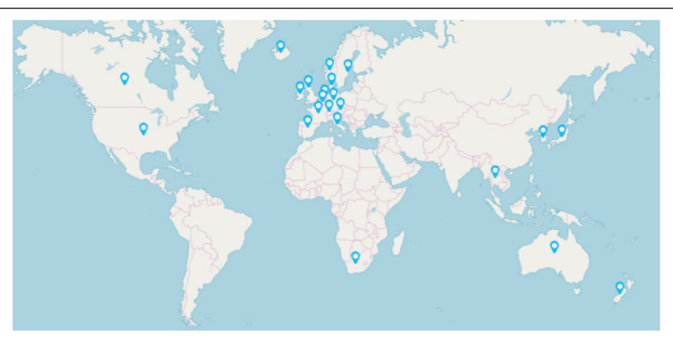
Fig. 2 Countries represented in this study that had a control program for paratuberculosis between 2012 and 2018

Europe. The majority of countries without a control program for paratuberculosis were in South and Central America, Asia and Africa (19 of 25 countries) and only 5 (20%) were in Europe (Table 6).